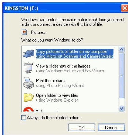
Figure 1 USB Storage Device Configuration Menu